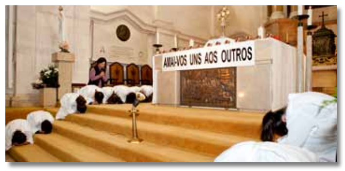
November 24, 2012, at Basilica of Our Lady of the Rosary: "Love one another"

these children, their loved ones and their catechists and teachers.