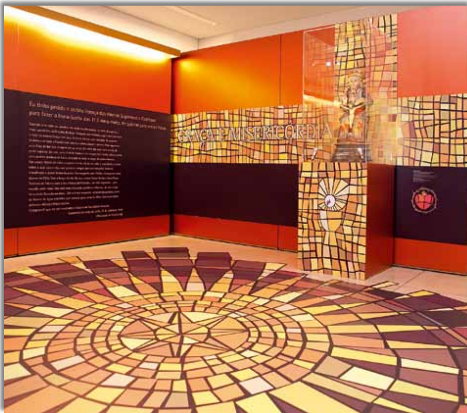
Detail of the exhibition “On the trail of light – the apparitions of Fatima”

ery for the current pastoral year, the Rector of the Shrine of Fatima stressed that the celebration of the Centennial of the Apparitions “doesn’t intend simply to mark a historical date, but rather to be a vehicle for evangelizing and a way to conversion and to the encounter with Christ”.