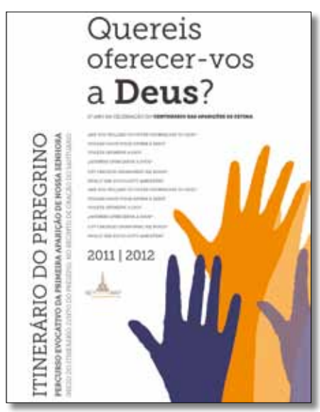
Itinerary available in seven languages

Next to the Nativity Scene located to the left of the Rectory Building, in a place properly identified, individually or in a group, the pilgrim is invited to pick up a leaflet containing the suggested itinerary, although he may make the walk (mentally), without going physically through the sites.