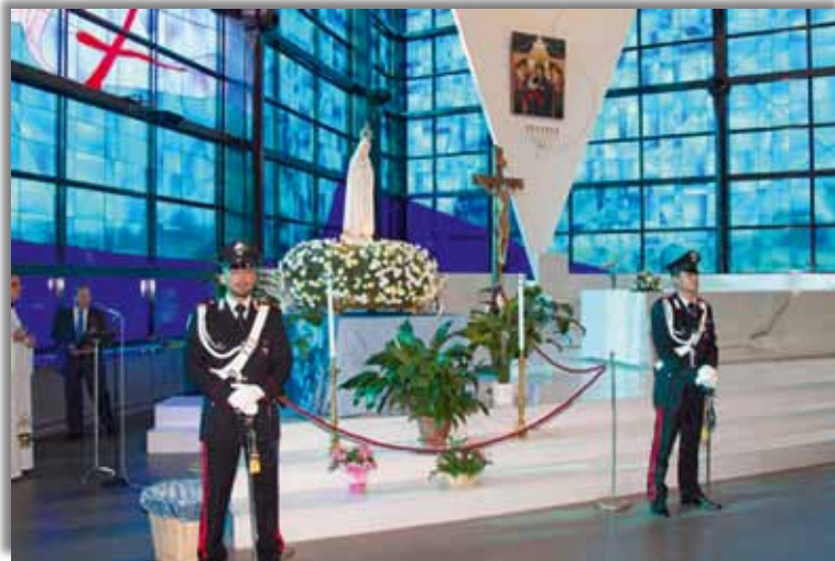
May 13, 2011, at Shrine of Our Lady of Divine Love, Rome

Cardinal Rylko, President of the Pontifical Council for the Laity, where Cardinal Rylko shows his satisfaction for the "taking of a fortunate initiative for the Church and all the dioceses (of Italy) and for the fact that the pilgrimage has "a missionary purpose, through the preaching of the Message of the Gospel, in view of the new evangelization to which the Holy Father repeatedly calls us".