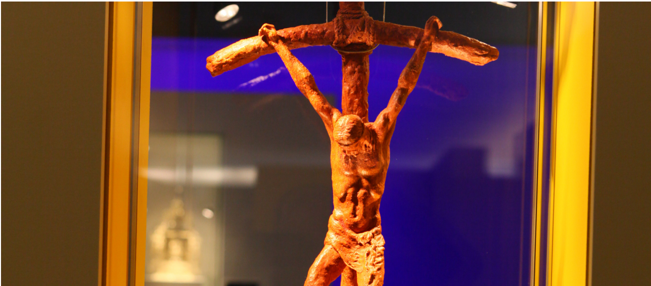
In this valley of tears