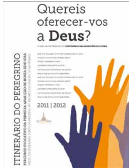
Itinerary available in seven languages

Next to the Nativity Scene located to the left of the Rectory Building, in a place properly identified, individually or in a group, the pilgrim is invited to pick up a leaflet containing the suggested itinerary, although he may make the walk (mentally), without going physically through the sites.