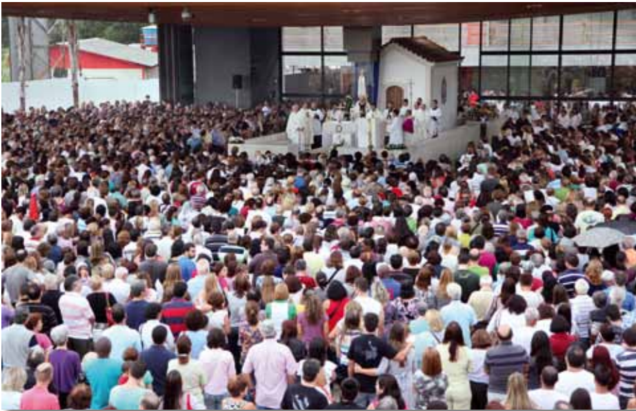
Little Chapel of Fatima, in Rio de Janeiro, inaugurated on May 28, 2011